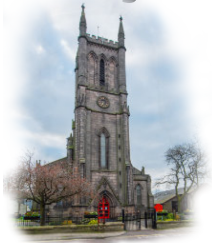
St George and